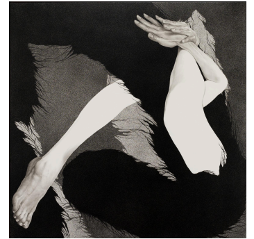
Samantha Yun Wall, Wild Seeds, No. 3 , 2024