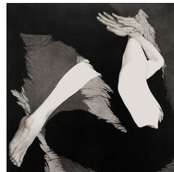
Samantha Yun Wall, Wild Seeds, No. 3 , 2024