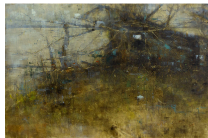
Kaori Maeyama, The Batture III: Refuge , 2021