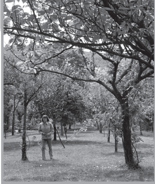
Joan Mitchell in Vétheuil, France, circa 1984

Joan Mitchell was born in Chicago in 1925 and earned a BFA from the Art Institute of Chicago in 1947. In the early 1950s she participated in the vibrant downtown New York art scene and spent time with many other painters and poets. It was during this time in New York that she began to paint in a way known as Abstract Expressionism.